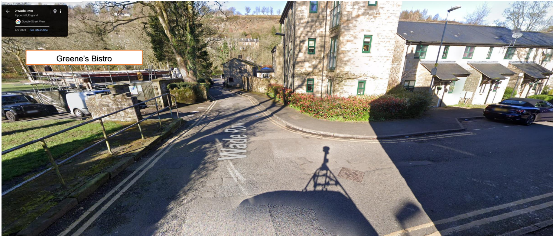
WADE STREET & HOPKINSON CLOSE