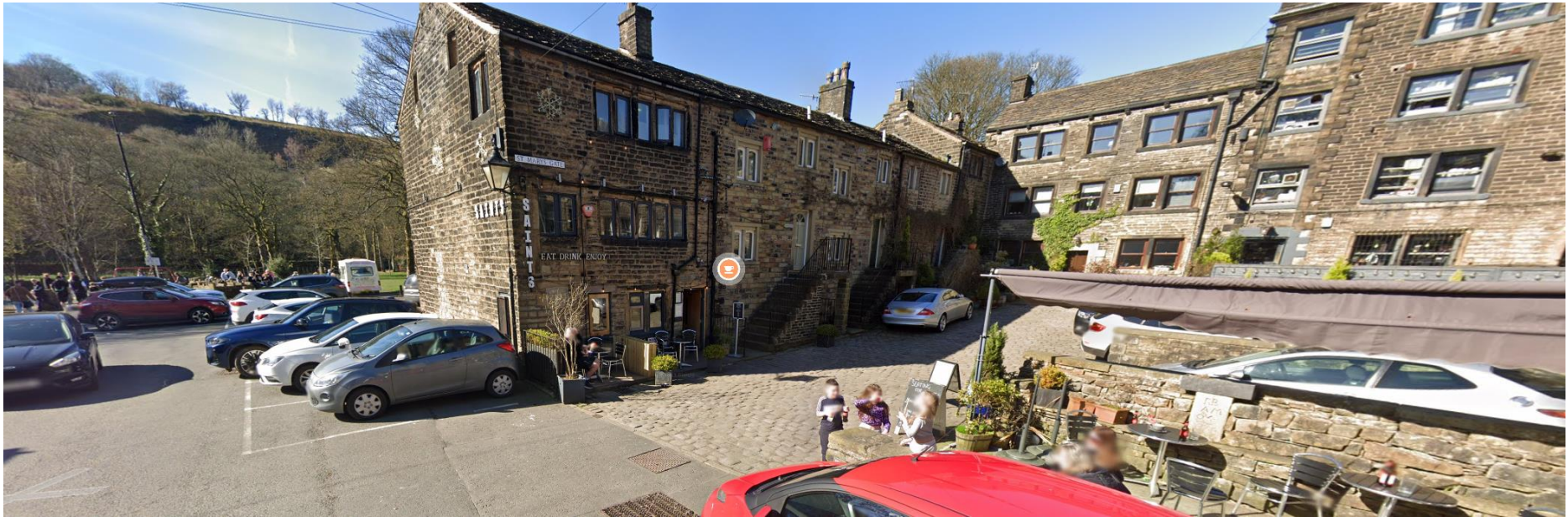
ST. MARY'S GATE