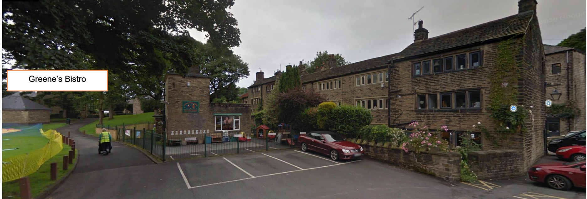
ST. MARY'S GATE